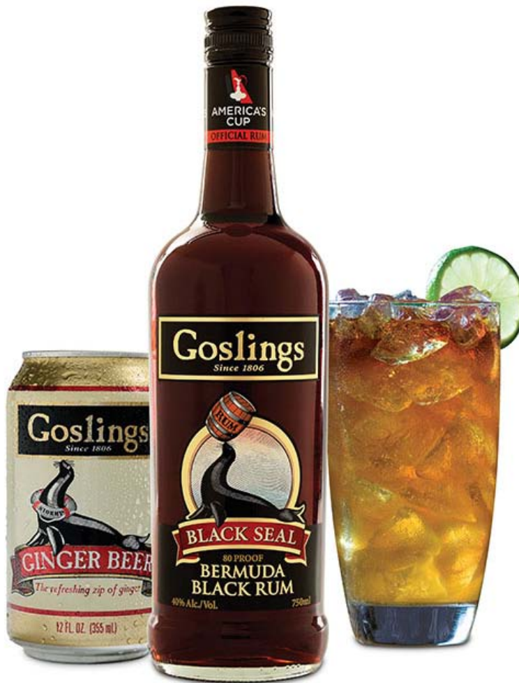
MONARQ will represent the Goslings rum portfolio from July 2016 in all countries of Latin America and the Caribbean

Goslings Rums of Bermuda, the 210-year-old producer of award-winning rums, has formed a regional partnership with the MONARQ Group. MONARQ will represent the Goslings portfolio from July 1, 2016 in all countries of Latin America and the Caribbean. Goslings Brothers Ltd is Bermuda's oldest business and largest exporter. Since 2004, Goslings Rums has been spearheading a major international expansion of the brand.