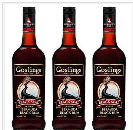
Monarq will now represent Goslings Rum across Latin America

Goslings Rums of Bermuda and agent and distributor Monarq Group have entered into a regional distribution partnership covering all countries across Latin America and Caribbean.